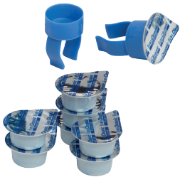
Cleanic Single Dose