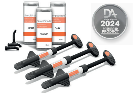
SimpliShade™ Bulk Fill Flow