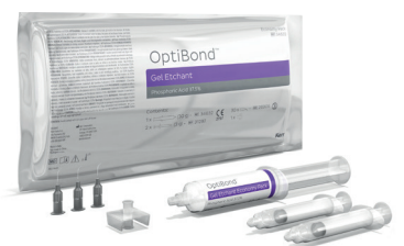
OptiBond™ Gel Etchant